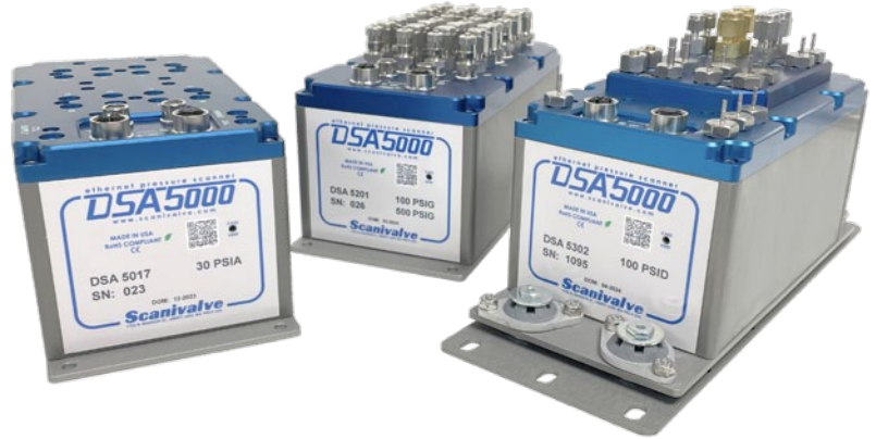
From Left to Right: DSA5000 - Standard Gas, DSA5200 - All-Media, DSA5300 - Gas / iDDS with "QD" Header and Shock-Mount